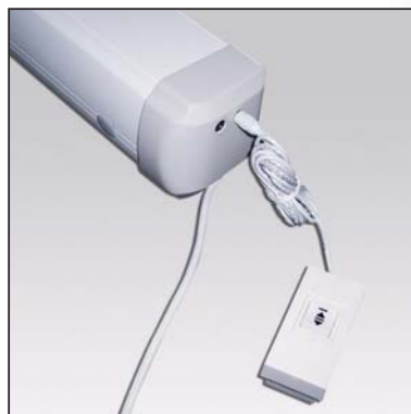
12v manual switch

Provides fast and efficient installation. Snap on snap off patented design.