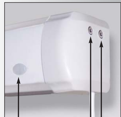
Infrared signal window 12v socket for beamer control 12v manual switch