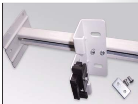
Fits brackets 37078 and 37079