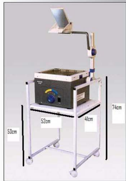
49010 AV table