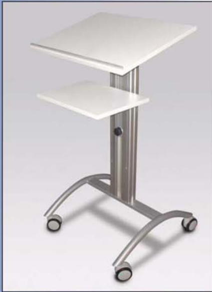
49481 Media Trolley Aluminum column, steel shelves. Adjustable height 100-145cm Includes 3 steel panels 32x35cm. Panels can be adjusted to required position. Load capacity 10 kgs. 4 castors, 2 lockable. K.D. shipping weight 16 kgs.