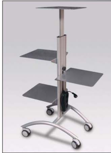
49482 Lecturn Aluminum column, steel shelves. Adjustable height 100-130cm. Includes two shelves 45x60cm + 30x40cm. Both shelves are adjustable. 4 castor wheels, 2 lockable. K.D. shipping weight 17 kgs.