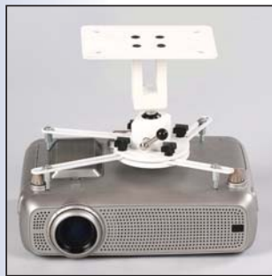
Model # 54101 Residence Height: 15cm Weight: 1.5 kgs. Carton size: 18x13x25cm 0.006cbm 12/export carton