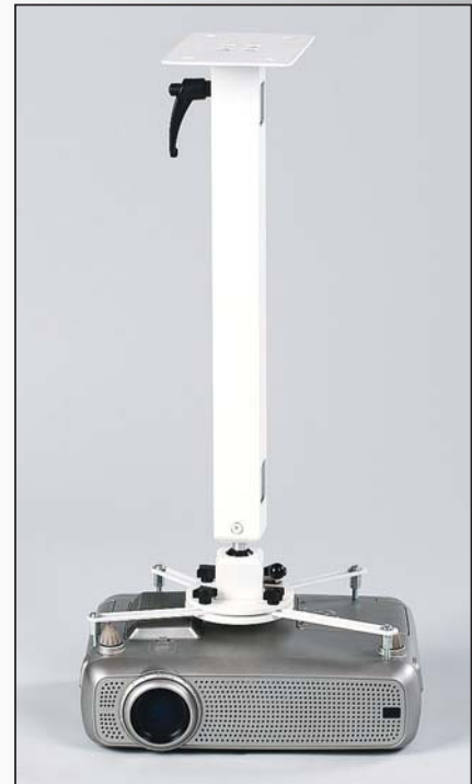
Model # 54103 Standard Adjusts from 60cm – 110cm with locking position handle. Weight: 3 kgs. Carton size: 20x14x70cm / 0.0196cbm