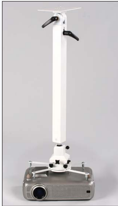
Model no. 54104 Deluxe Adjusts from 67cm – 110cm with locking position handle. Additional locking handle for ceiling angle adjustment. Quick release locking feature to allow projector and universal bracket to be removed easily for security storage. Weight: 3.5 kgs. Carton size: 20x14x70cm / 0.0196cbm