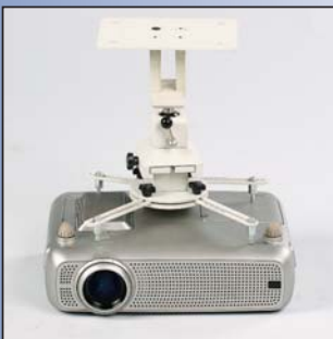
Model # 54102 Residence with Quick Release Same as 54101 with Quick Release locking feature to allow projector and universal bracket to be removed easily for security storage. Weight: 2.0 kgs.