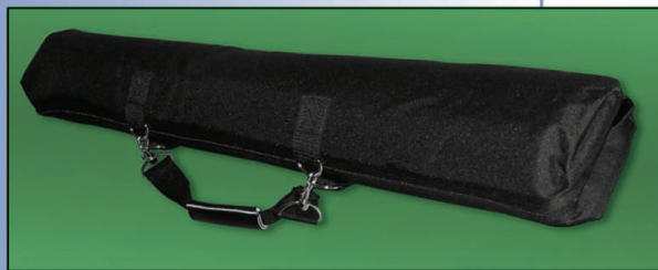
Padded carry bag. 60322, 60333